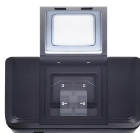
Fingerprint recognition mode