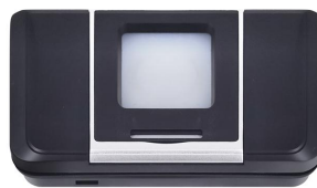
Stamp scan mode