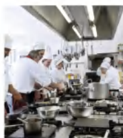
Bright Kitchen Bright Stove