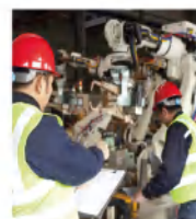
Production Safety Supervision