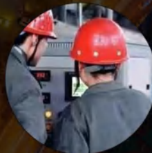
Production Safety Supervision