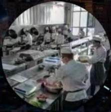
Bright Kitchen Bright Stove