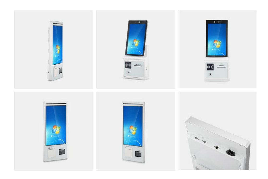
SP18 Smart POS Terminal Series

SP18 is a vertical large screen all-in-one cashier terminal, equipped with 15.6-inch full HD touch screen, Android 7.1 operating system, it has a built-in 80mm high-speed thermal printer, support automatic paper cutting, can print tickets, label paper. SP18 can choose to drop desktop models or wall-mounted models, support 7 * 24 hours of non-stop work, suitable for a variety of places need to order cashier.